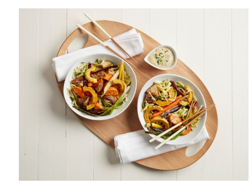
Charred Green Onion Miso Ranch Dressing

With a fusion of flavors and the familiar comfort of ranch, this dressing is sure to elevate any salad.