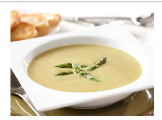
Cream of Asparagus Soup with Soymilk

Spring is the perfect time to embrace fresh flavors and try new recipes. This season, we're happy to share highlight recipes for a soup and salad dressing that celebrate the versatility and goodness of soy while leaving you feeling refreshed.